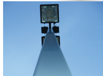
Figures 1-3: Use of existing system; minimal impact on aesthetics of pole