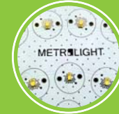
eHID to LED