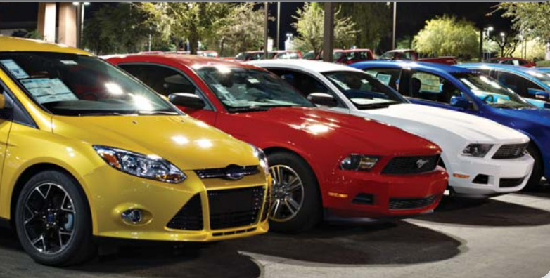
CARS UNDER TYPICAL 1,000W LIGHTING*